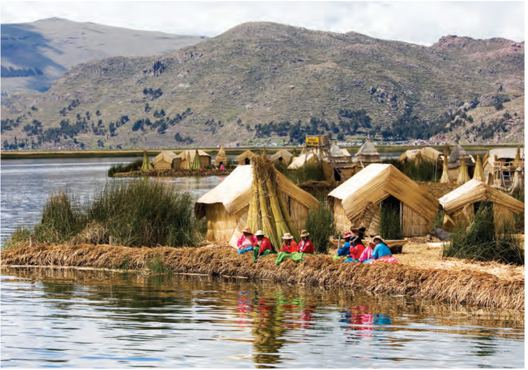
Local women gather on Uros Island

Aguas Calientes and our hotel, with time at leisure before dinner together tonight. B,L,D