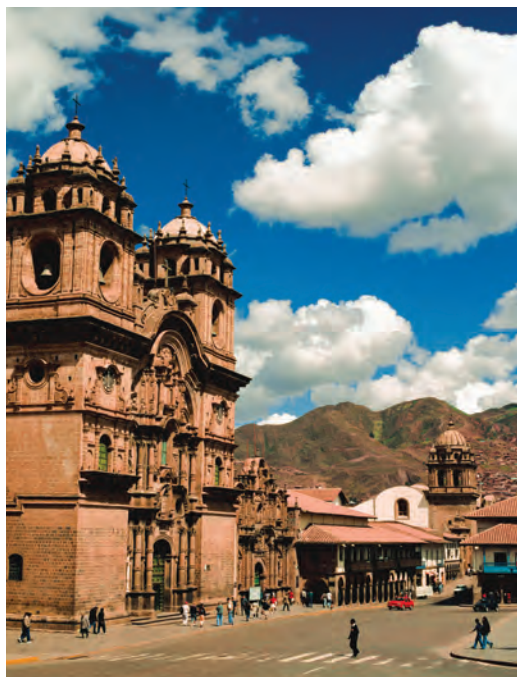
Plaza de Armas, Cuzco

Day 10: Puno/Lima/Depart for U.S. This morning we visit the mysterious burial towers ( chullpas ) at Sillustani over-looking Lake Umayo. After lunch we transfer to the airport for the flight to Lima, where we