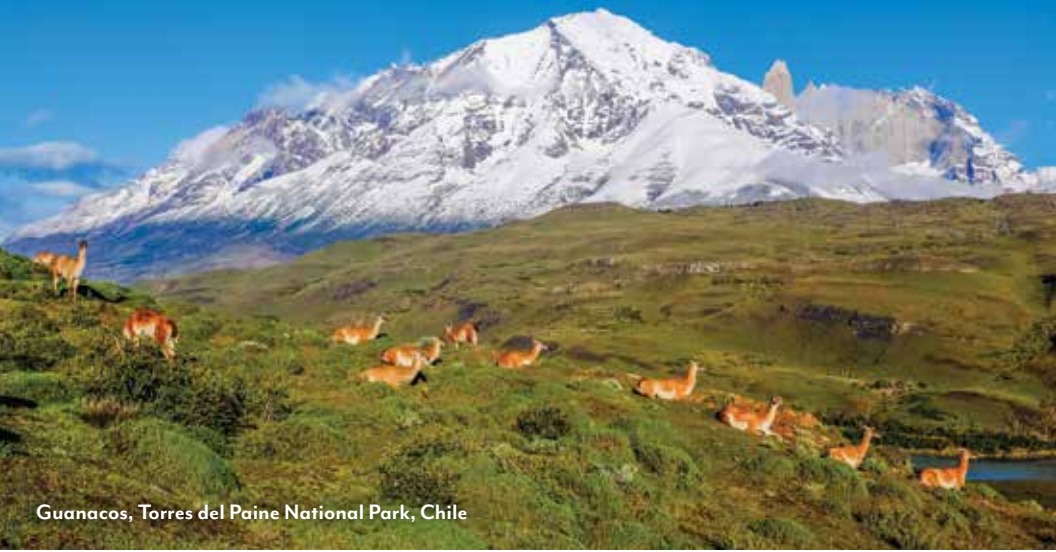
Guanacos, Torres del Paine National Park, Chile