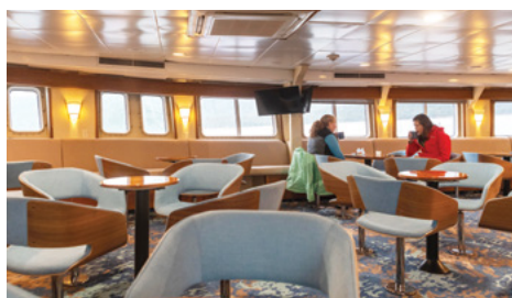
The lounge is the center of life aboard ship.

The ship features a library; global market; lounge with full-service bar and facilities for films, slide shows, and presentations; observation deck; partially covered sundeck with chairs and tables; and LEXspa. An open Bridge provides guests an opportunity to meet the officers and captain and learn about navigation.