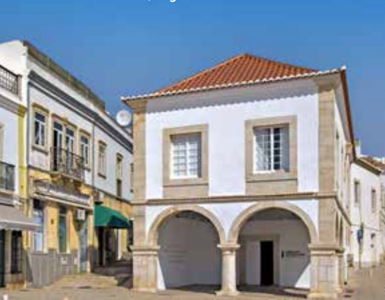
Slave Market Museum, Lagos