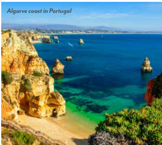
Algarve coast in Portugal

After enjoying breakfast on the ship, disembark and transfer to the airport for your return flight home or continue on to the Barcelona Post-Program. (B)