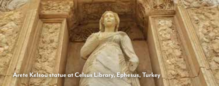
Arete Kelsou statue at Celsus Library, Ephesus, Turkey