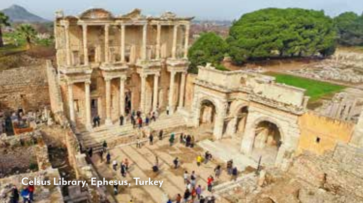
Celsus Library, Ephesus, Turkey

Ancient Ephesus is a city of stories, ones that trace from as far back as 1050 B.C. through the Roman Imperial era to the age of early Christian evangelism. A port city and center of trade on the Mediterranean for millennia, its first settlers were Anatolian people who would later be captured by Ionian tribes, who were unseated by the Persians, who were then conquered by legendary Greek leader Alexander the Great. However, most of the well-preserved ruins you will see today in this UNESCO-inscribed Turkish city are remnants of an age of extreme wealth and prosperity enjoyed under the first century reign of Caesar Augustus. As the new capital city of the Roman Empire, the Hellenistic Great Theatre was renovated with lavish Roman aesthetics; the grand, two-story Library of Celsus was constructed; and elaborately adorned villas known as the Terrace Houses were built for its most elite residents. Very close to Ephesus you may also see what remains of the Temple of Artemis, one of the "Seven Wonders of the Ancient World." This temple to the goddess Artemis, built in the 6th century B.C., was set on fire, then rebuilt several times only to be destroyed by a Christian mob around 401 A.D. Believing that the Virgin Mary lived here after the death of Jesus, Ephesus has since become a site of Christian pilgrimages that continue to this day.