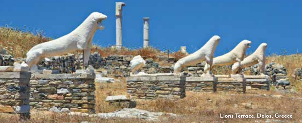
Lions Terrace, Delos, Greece

The Roman writer Cicero (106 to 43 B.C.) observed of Athens that “wherever you set your foot, you encounter some memory of the past.” In Greece and Turkey, the stories of antiquity come to life. St. John the Apostle is believed to have penned the Book of Revelation on Patmos; the legend of the lost utopian city of Atlantis lives on in Santorini; and it is on these mythological islands that Odysseus sought redemption in the Underworld and where Orpheus retrieved his first love. Visit the Hellenistic Grand Theater in Ephesus, walk the Sacred Way of Delos and discover ancient Akrotiri—the “Minoan Pompeii.” Enjoy exclusive cultural enrichments, including a folklore performance, a culinary demonstration and the Island Life® forum with residents of Patmos who will share their candid perspectives about life today.