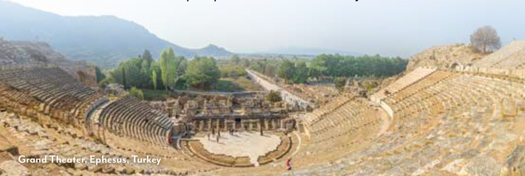
Grand Theater, Ephesus, Turkey

The Roman writer Cicero (106 to 43 B.C.) observed of Athens that “wherever you set your foot, you encounter some memory of the past.” In Greece and Turkey, the stories of antiquity come to life. St. John the Apostle is believed to have penned the Book of Revelation on Patmos; the legend of the lost utopian city of Atlantis lives on in Santorini; and it is on these mythological islands that Odysseus sought redemption in the Underworld and where Orpheus retrieved his first love. Visit the Hellenistic Grand Theater in Ephesus, walk the Sacred Way of Delos and discover ancient Akrotiri—the “Minoan Pompeii.” Enjoy exclusive cultural enrichments, including a folklore performance, a culinary demonstration and the Island Life® forum with residents of Patmos who will share their candid perspectives about life today.