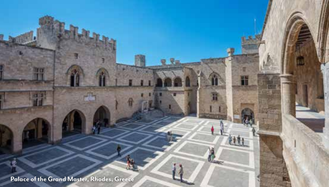
Palace of the Grand Master, Rhodes, Greece