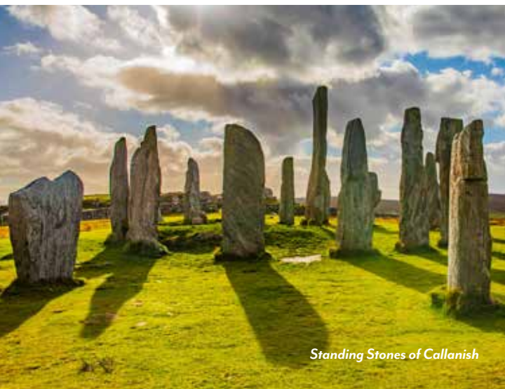
Standing Stones of Callanish