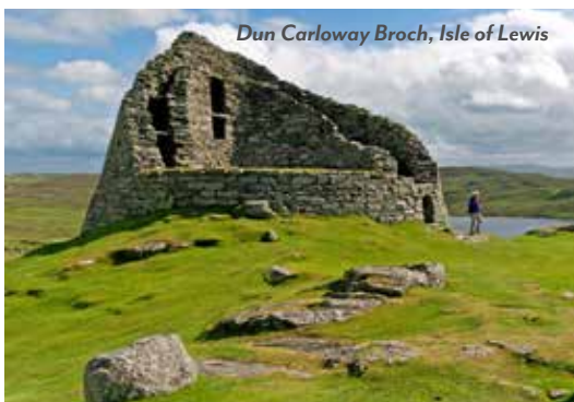
Dun Carloway Broch, Isle of Lewis