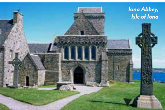
Iona Abbey, Isle of Iona

Explore the island of Streymoy. Begin in the municipality of Tórshavn, founded by Norsemen in the 10th century. Navigate the narrow, historic lanes of Tinganes, which are bordered by traditional grass-roofed houses. Transfer to Kirkjubøur to visit the ruins of St. Magnus