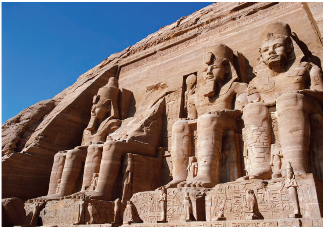
The magnificent temples at Abu Simbel commemorate Ramses II and his queen, Nefertari.