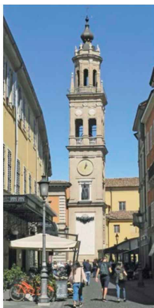
Clock tower, Parma

Knowledgeable Lecturers deepen your appreciation for the region and its history, culture and current events.