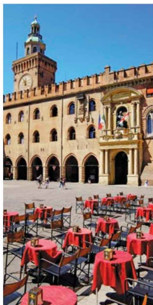
Piazza Maggiore, Bologna