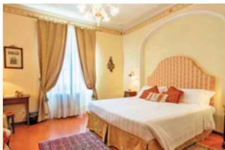
Villa Marsilli | Cortona