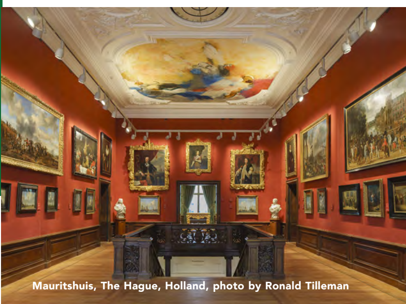
Mauritshuis, The Hague, Holland