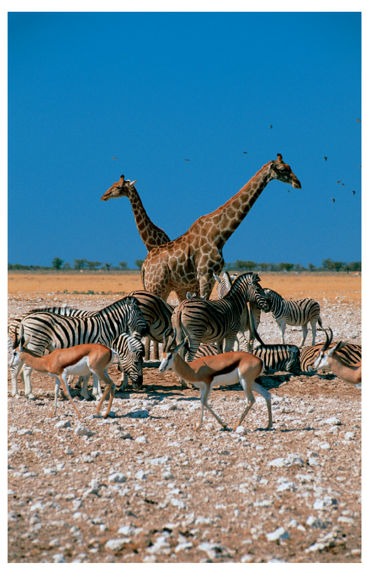
Tarangire National Park teems with diverse wildlife.

Day 10: Serengeti We embark on more wildlife drives today. We have the chance to see some – or all – of Africa's "Big Five:" lion, Cape buffalo, elephant, rhino, and leopard, along with wildebeest, zebra, eland, gazelle, and other plains animals, and some 500 species of birds. B,L,D