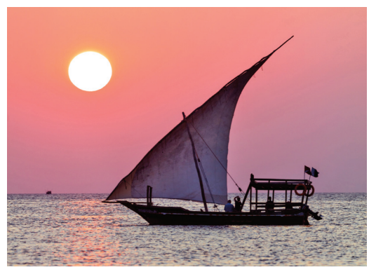
Traditional dhow sails off Zanzibar.

This morning we take a quick flight to Dar es Salaam, Tanzania's largest city. Upon arrival, we will have a day room at a local hotel and an afternoon at leisure.