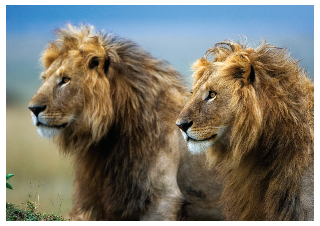
More than 3,000 lions roam the Serengeti.

the world's largest intact and perfectly formed volcanic caldera. The unique biosphere here has remained unchanged for eons; towering walls encircle the crater's floor which represents Africa in microcosm: grassland, swamps, lakes, forests, and some 25,000 mammals, including elephant, black rhinoceros, lion, hippo, and zebra. Then we return to our lodge for an afternoon at leisure. B,L,D