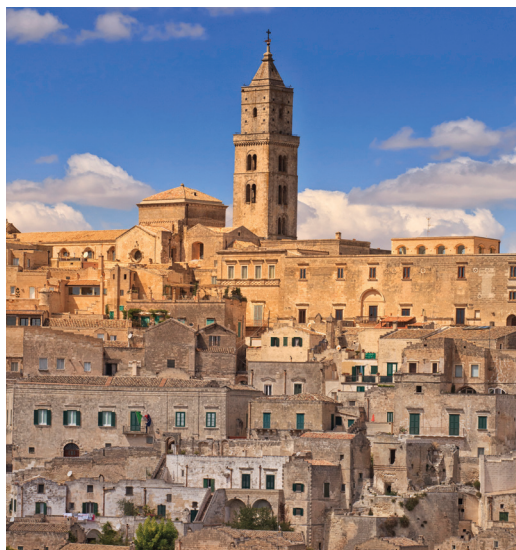
We spend two nights in ancient Matera.

Day 14: Sorrento/Amalfi Coast We embark this morning on a breathtaking drive along the winding, cliff-top Amalfi Coast road between Sorrento and Amalfi above the glistening Tyrrhenian Sea – with stops for photos along the way. This afternoon is at leisure; tonight we bid “ arrivederci ” to Italy and our fellow travelers at a farewell dinner. B,D