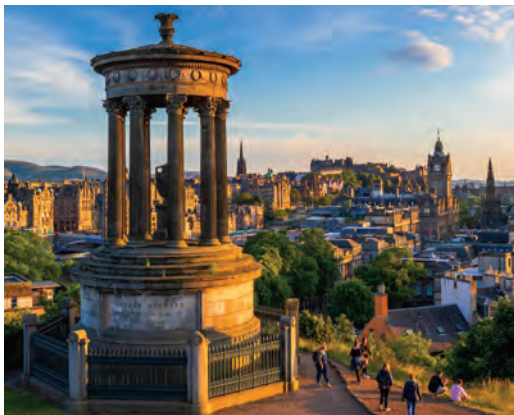
Edinburgh skyline, from Calton Hill

On this program, as on all Dartmouth trips, a distinguished member of Dartmouth's faculty will accompany our group, adding a unique and memorable perspective. The faculty leader will present an informative educational program, including lectures and discussions. As this brochure goes to press, the faculty leader who will accompany the program has not yet been confirmed, but we wanted to send the brochure in time for you to participate. When a faculty leader is confirmed Dartmouth Alumni Travel will update the website and send an announcement out to travelers on this program.