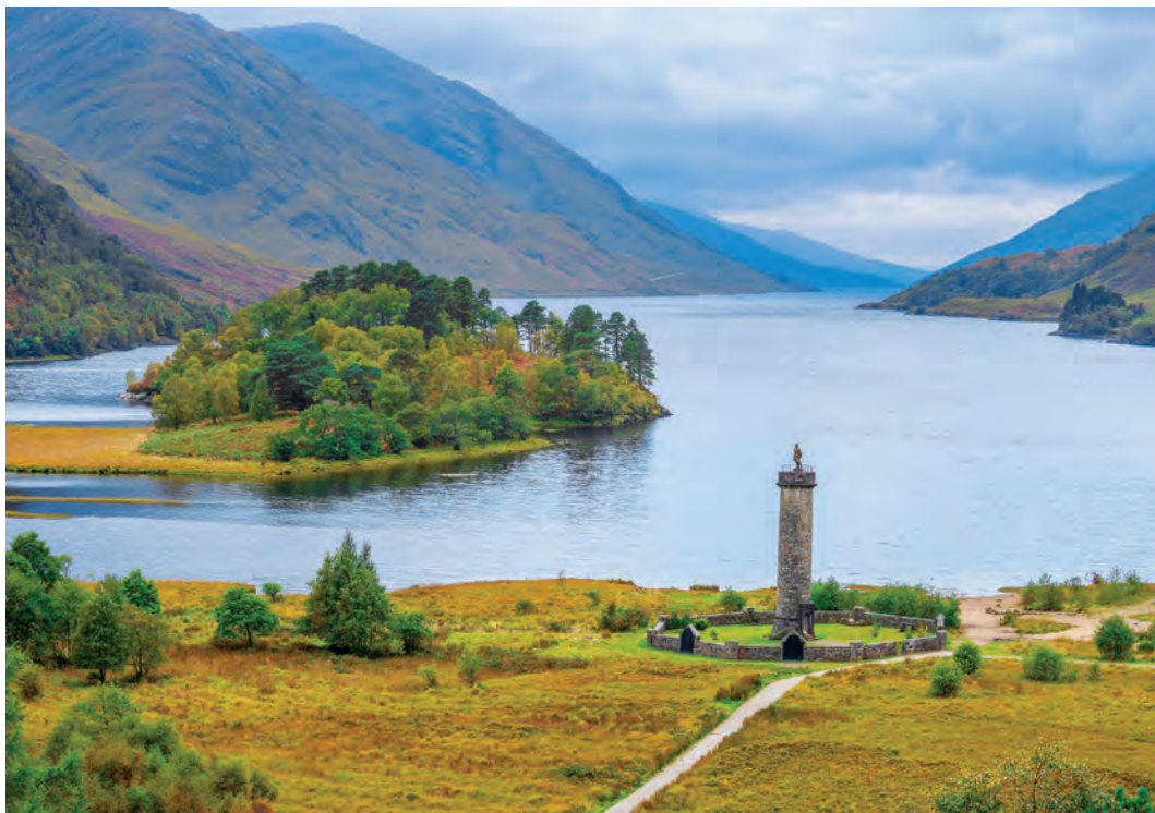
We'll visit the Glenfinnan Monument honoring "Bonnie Prince Charlie" on Day 5.

Day 5: Fort William/Isle of Skye We embark on a full-day excursion to the Isle of Skye, the largest of Scotland's Inner Hebrides known for its vivid history, strong Gaelic influence, and stunning scenery. En route, we make a photo stop at Glenfinnan Monument honoring "Bonnie Prince Charlie" for his leadership in the Jacobite Rising of 1745. Then we board a ferry for Armadale on the southern tip of the Isle of Skye, where our touring begins with a visit to Armadale Castle and Gardens, where we have lunch. Next we set out on a scenic drive through the imposing Cuillin Hills (or "Black Cuillin"). Returning to the mainland via the Skye Bridge, we stop to visit iconic Eilean Donan Castle then dine tonight at our hotel. B,L,D