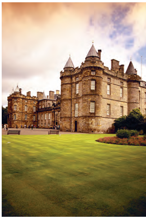
Scotland is home to more than 1,000 castles.

Day 12: Depart for U.S. We transfer this morning to the Edinburgh airport for our return flights to the U.S. B