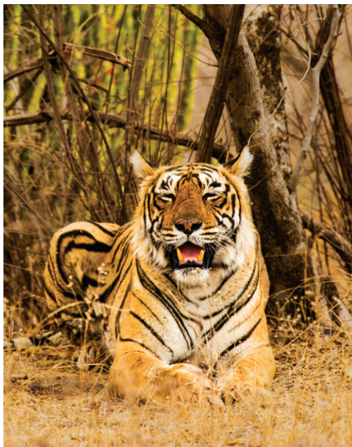
Bengal tiger rests in Ranthambore.

Day 16: Varanasi/Delhi We fly this afternoon to Delhi, where the evening is at leisure. B