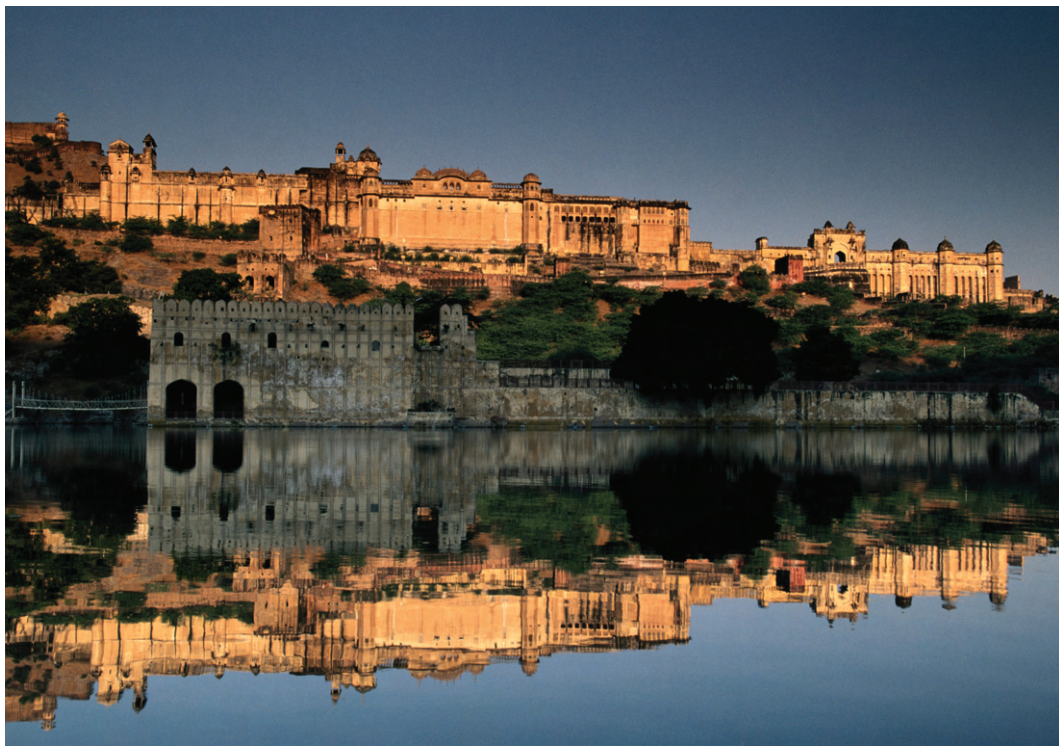
Visit Amber Fort, a UNESCO World Heritage site, on Day 6.

Day 8: Jaipur/Ranthambore We travel today to Ranthambore National Park, the former hunting ground of the Maharajah of Jaipur and now a 512-square-mile natural preserve that is home to hundreds of species of birds, reptiles, mammals, and of course, Bengal tigers. This afternoon we take our first game drive through the park. B,L,D