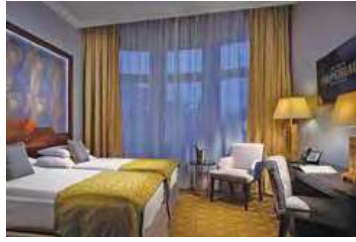
Art Deco Imperial Hotel | Prague, Czech Republic