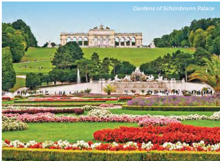
Gardens of Schönbrunn Palace