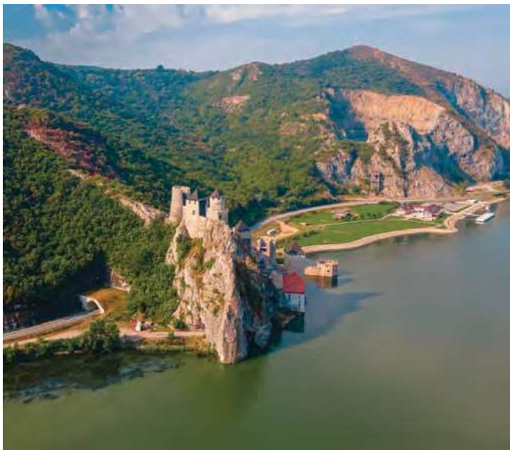
Banks of the Danube, Serbia