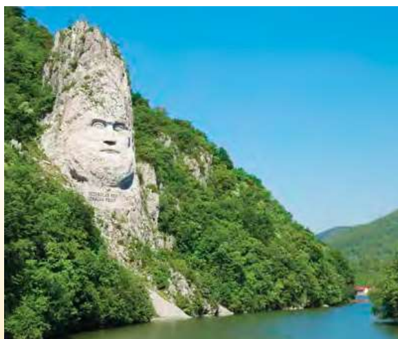
Decebalus stone sculpture, Iron Gate Gorge