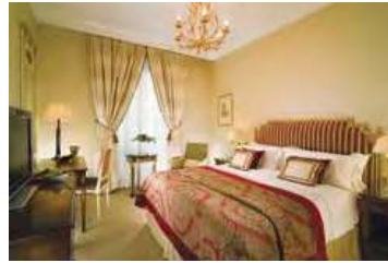
Sofia Hotel Balkan | Sofia, Bulgaria