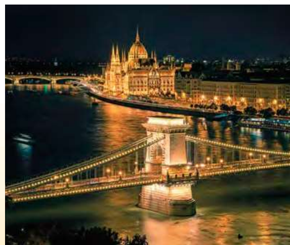
Budapest at night