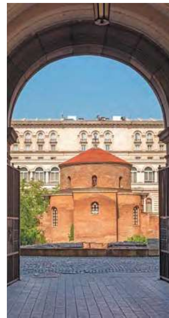
St. George Rotunda, Sofia