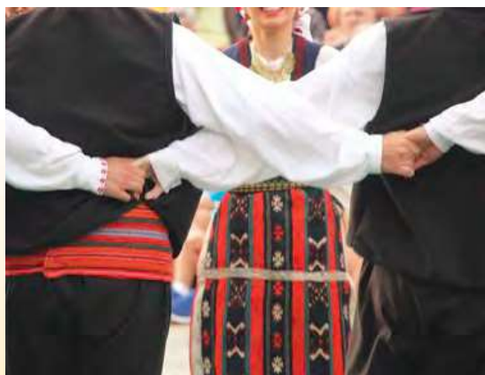
Serbian folk dancing

• Jewish Quarter. Witness Budapest's Great Synagogue, the poignant Shoes on the Danube Bank memorial and other sites.