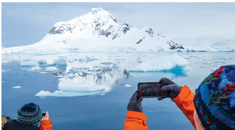
Guests photographing from a Zodiac in Paradise Harbor, Antarctica.

On a Lindblad Expeditions voyage, photography is never an afterthought—it's central to the expedition experience. A photography expert and a certified photo instructor (CPI) join each voyage to assist travelers with everything from camera settings to composition. Every guest—from smartphone camera users to advanced hobbyists—can stand side by side with top photographers, pick up tips in the field, and return home with the photos of a lifetime. With the complimentary OM System Photo Gear Locker, you can field test new lenses, camera bodies, and more.