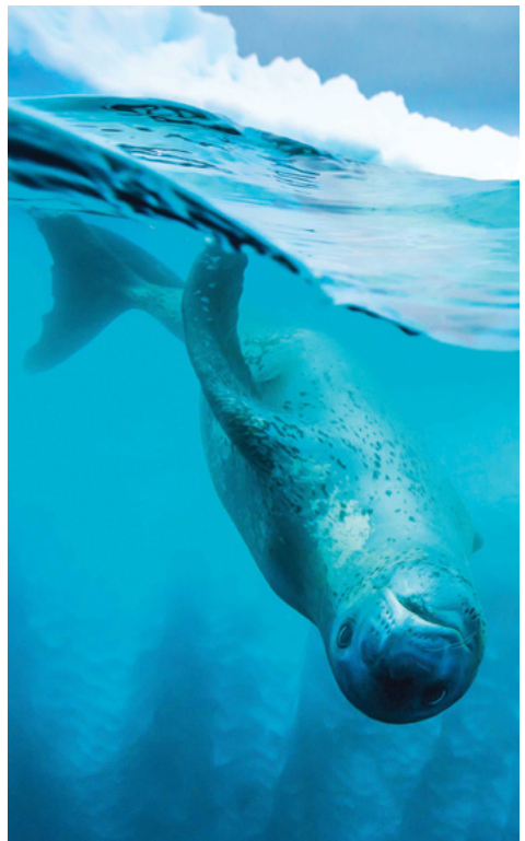
A curious adult leopard seal.

As part of our in-depth undersea program, an undersea specialist uses a high-definition video camera and deploys a remotely operated vehicle (ROV) that allows us to peer through steely polar waters—up to 1,000 feet beneath the surface. Footage is shared during daily recaps, inviting guests to witness surprising and unexpectedly colorful sea life from the comfort and safety of our ship.