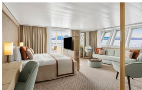
Newly renovated Category 7 suite with balcony.

All cabins and suites face outside with windows or portholes, and have a private bathroom and climate controls. Equipped with Wi-Fi, multiple electrical outlets, USB outlets, full-length mirror, and phones. TV featuring entertainment on demand, live feed from onboard presentations, bow camera, and ship's position. Luxury bed linens and pillows. Botanically inspired shampoo,