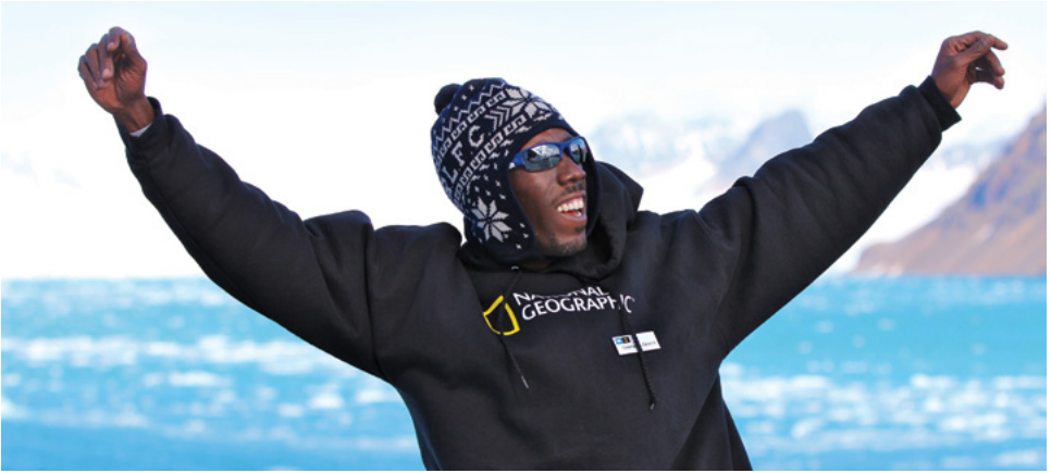
A guest marvels at landscape from aboard the ship.