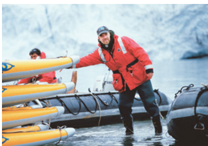
The expedition staff helps guests board kayaks safely and swiftly.

Many are veteran polar guides who have worked with us for decades, chosen for their extensive knowledge of subjects like geology, wildlife biology, and climate science. They, along with the guest speakers who join us on board, give rich context to the wildlife and landscapes we encounter ashore.