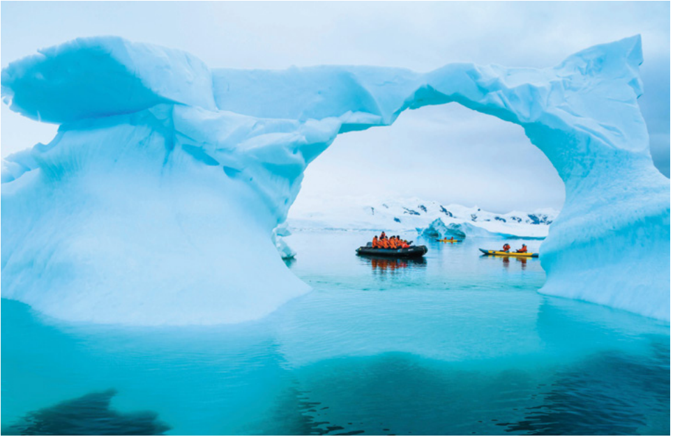
Guests exploring by Zodiac in Antarctica.

an evening Zodiac cruise amid porpoising penguins. While wildlife is magnificent, ice defines the Antarctic. You'll get to know ice up close and personal—from icebergs the size of islands, bergy bits and near-vertical glaciers, to the fragile, nearly invisible layers that have just begun to freeze. One day, we might set out by kayak to encounter towering icebergs at water level; embark on a Zodiac excursion in search of seals and blue-eyed shags; or walk amid thousands of Adélie and gentoo penguins. The next, we might experience the thrill of the ship crunching through pack ice. Everywhere we go in Antarctica we're surrounded by opportunities to capture uniquely beautiful images. Along the way your expert expedition team will enrich every experience. (B,L,D)