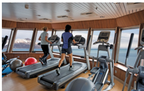
Fitness center with panoramic views.

The vessel is staffed by a wellness specialist and features a glass-enclosed fitness center, outdoor stretching area, LEXspa treatment room, and sauna.