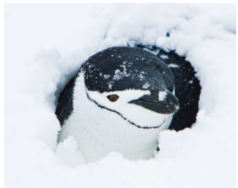
A chinstrap penguin burrowed in the snow.

This morning, the ship will be moored off of King George Island once again. Following disembarkation and Zodiac rides to shore, our flight departs the White Continent and returns to Puerto Natales where we overnight. (B,L,D)