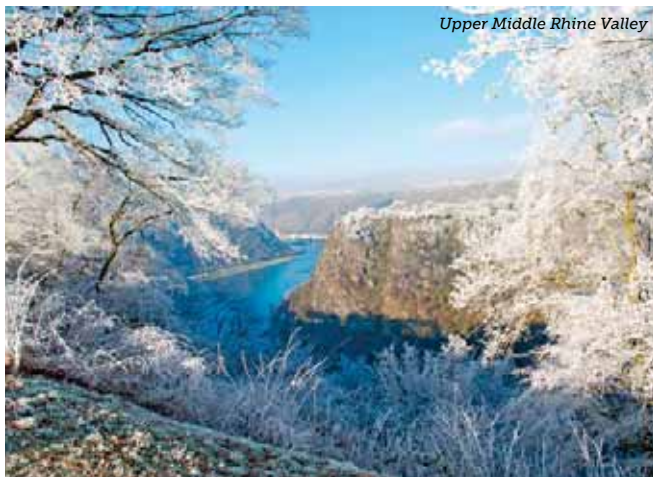
Upper Middle Rhine Valley