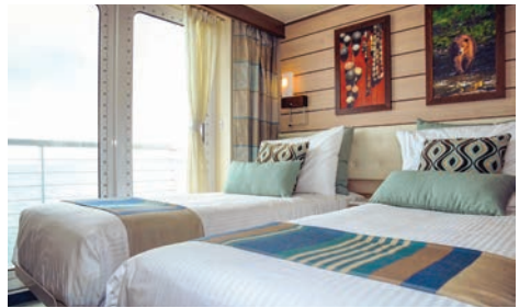
Category 4 cabin with single beds (which can be converted to a Queen) and a private step-out balcony.

All cabins and suites face outside with windows or portholes, private facilities, climate controls, and Wi-Fi connections and USB ports for mobile devices. Category 4 cabins have step-out balconies.