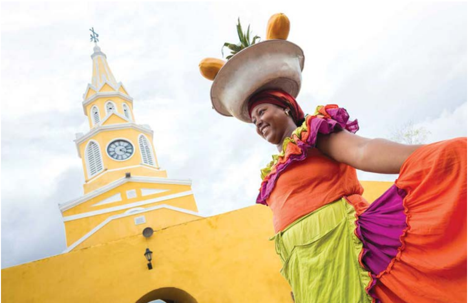
A Palenquera performer displays balance and brilliant colors in Cartagena.

Disembark in Panama City and transfer to the airport for your flight home. (B)