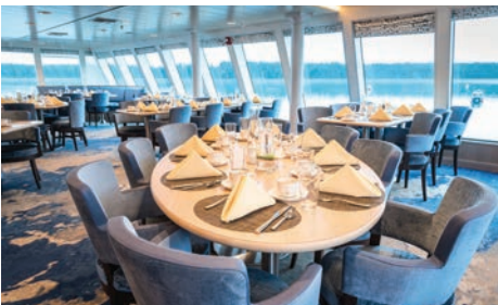
The casual dining room with its expansive windows.

Served in single seatings with unassigned tables for an informal atmosphere. Cuisine is fresh, sustainable, accented with regional flair, and served plated.