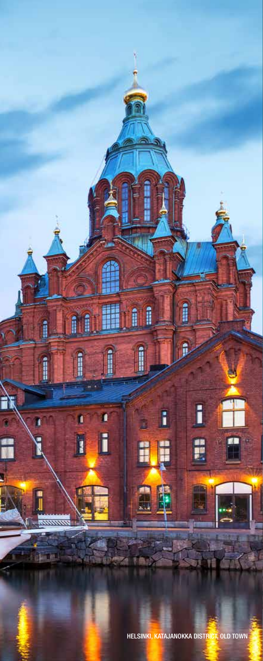
HELSINKI, KATAJANOKKA DISTRICT, OLD TOWN