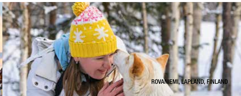
ROVANIEMI, LAPLAND, FINLAND