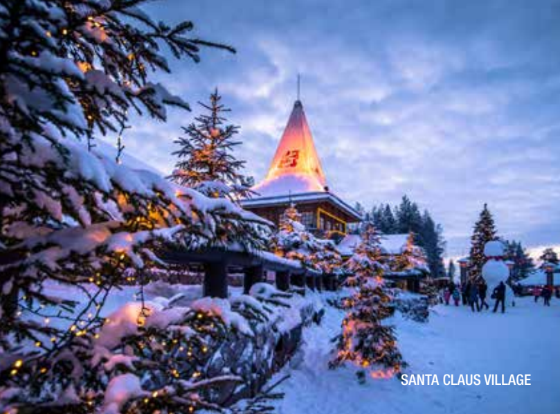
SANTA CLAUS VILLAGE