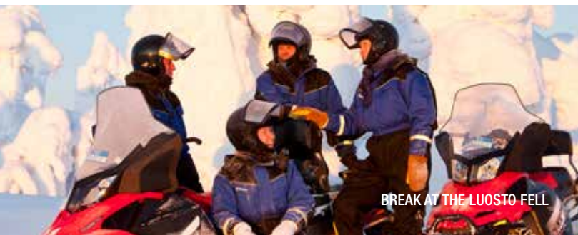
BREAK AT THE LUOSTO FELL

Learn about Arctic culture during a morning visit to a local artisan's workshop and home, with design pieces from Lappish natural materials that demonstrate traditions