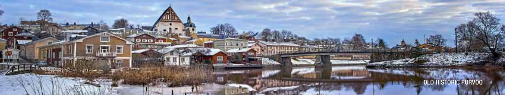
OLD HISTORIC PORVOO