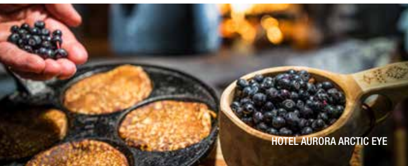
HOTEL AURORA ARCTIC EYE

Transfers to Rovaniemi Airport for flights home. (B)