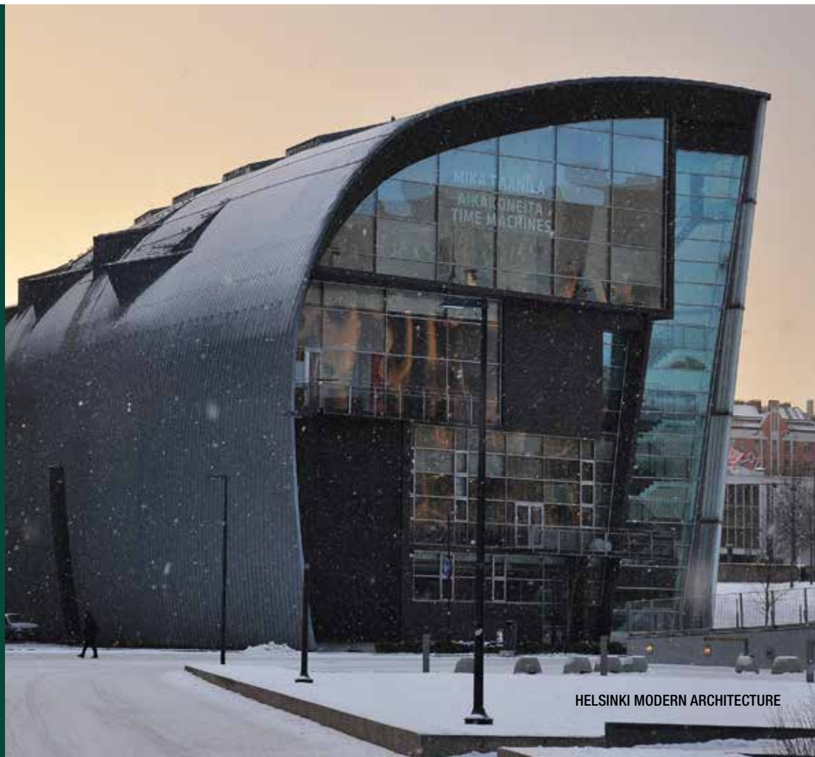
HELSINKI MODERN ARCHITECTURE

MEET reindeer herders in their remote wilderness homes and gain an authentic sense for this traditional way of life in Lapland. Feed the reindeer by hand, ride a reindeer-pulled sled, and learn about traditional handicrafts.