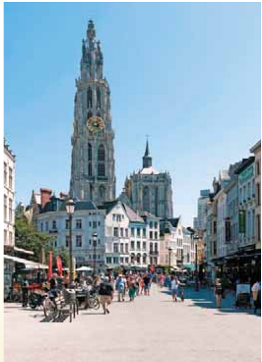
Cathedral of Our Lady, Antwerp