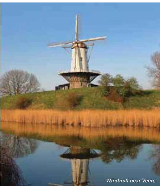
Windmill near Veere

• West Frisian Bicycle Tour. Ride through the breathtaking countryside near Enkhuizen, and pedal past little villages, churches and the pastoral dikes of the IJssel, the largest man-made lake in the Netherlands. (Active)