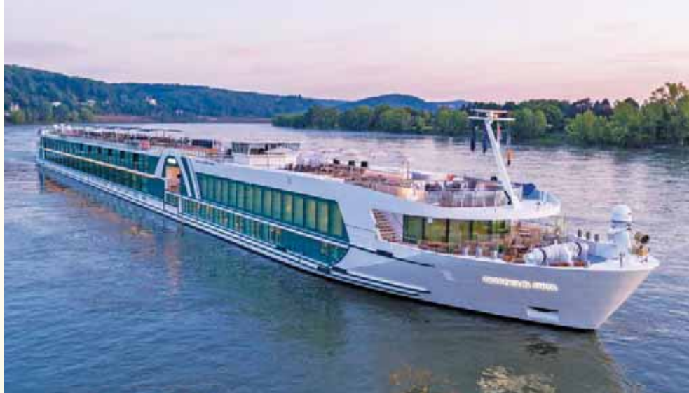
MS Amadeus Riva