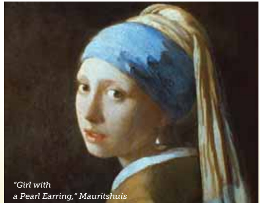
"Girl with a Pearl Earring," Mauritshuis