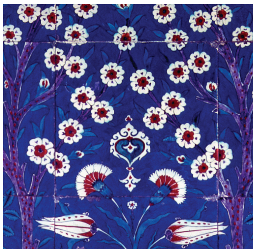
Exquisite Iznik tiles

Day 13: Antalya We discover Antalya's charming old city (Kaleici) on a morning walking tour through its narrow streets, past historic buildings, mosques, and parks. After lunch at a local restaurant, we visit Antalya's acclaimed Archaeological Museum, housing priceless artifacts unearthed from sites. B,L