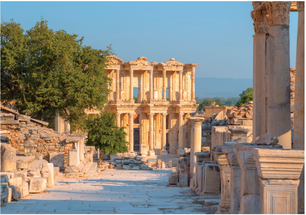
Ruins at Ephesus

Day 6: Istanbul/Gallipoli/Canakkale Leaving Istanbul this morning, we travel to the northern Aegean Coast for a brief visit to Gallipoli, haunting site of 31 Allied cemeteries from World War I. Then we ferry across the Dardanelles to Troy, once believed to exist only in Homer’s epic poem until the present site was discovered in the 1870s. After touring here, we continue on to Canakkale, where we spend the night. B,L,D