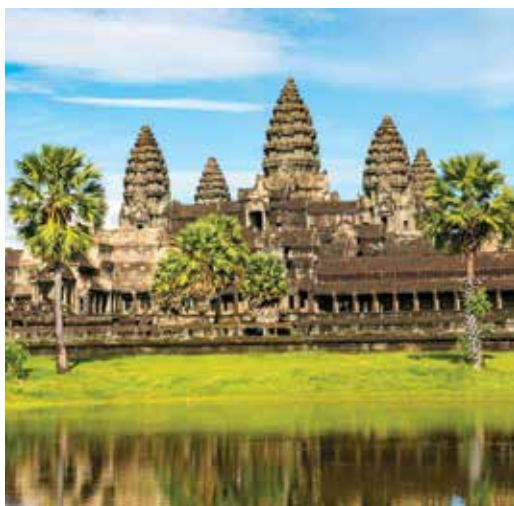
Angkor Wat (optional post-tour extension)

Day 14: Saigon This morning we visit the Cu Chi Tunnels, the infamous underground network from