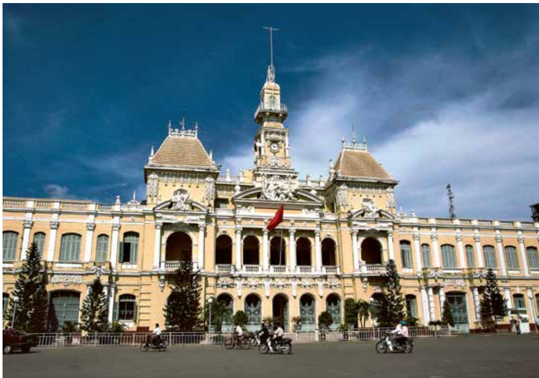
Observe the French architectural influences during a tour of Saigon on Day 13.

resort for a relaxing interlude. Tonight, we enjoy a cooking lesson and dinner in Hoi An. B,D