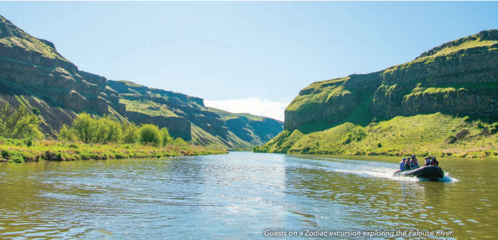
Guests on a Zodiac excursion exploring the Palouse River.