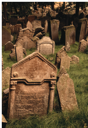
Prague’s ancient Jewish Cemetery

Day 14: Prague We spend the morning exploring the Hradcany (castle) district, home of the distinctive castle towering above the Vltava River. Dating to the 9 th century, the castle today is the seat of the president of the Czech Republic. Among the highlights of our tour: a visit to Gothic St. Vitus Cathedral and a stroll along Golden Lane, with its picturesque artisans’ cottages. The remainder of the day is free to continue exploring this enchanting city as we wish. B