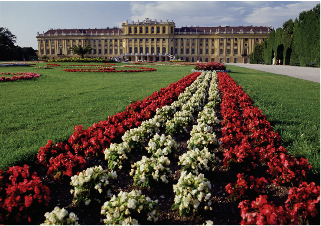
We visit Vienna’s majestic Schönbrunn Palace on Day 11.

Day 6: Krakow This morning we tour the Wieliczka Salt Mine, a UNESCO World Heritage site that is a virtual underground city, with galleries, lakes, chapels, and murals – all carved from salt. The mine’s centerpiece is the Chapel of Saint Kinga, with its chandelier and mural of The Last Supper , carved by three miners over a period of 68 years. Then we return to Krakow, where the remainder of the day is free for independent exploration, with lunch and dinner on our own in this historic capital. B