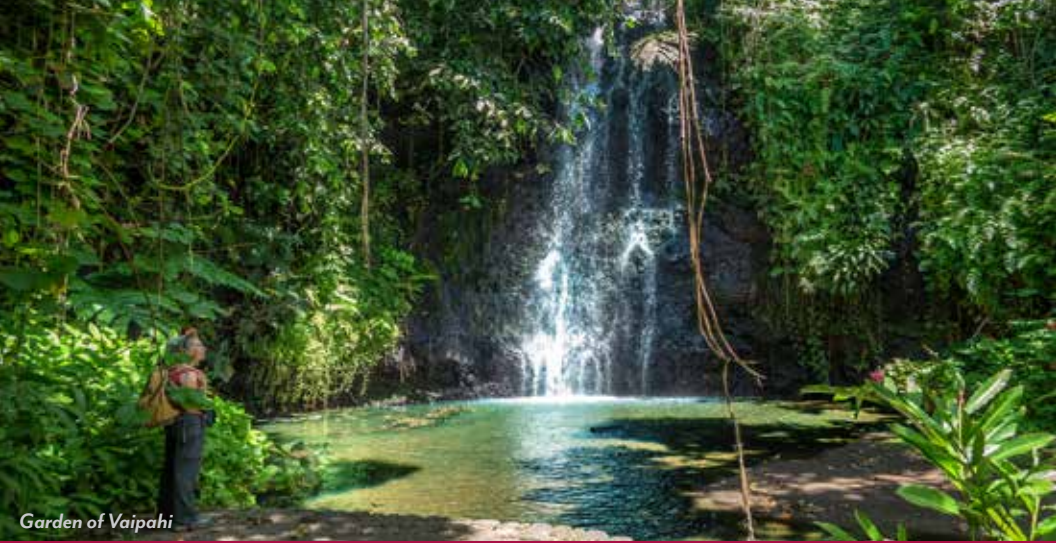
Garden of Vaipahi

of a vanilla plantation, which includes time to snorkel and potentially encounter stingrays. Next, dig your bare feet in the sand and savor an included beach barbecue lunch on a private motu, where you can also swim, snorkel or kayak. (B,L,D)