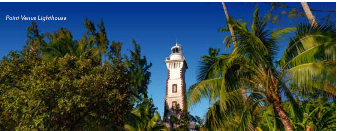
Point Venus Lighthouse

Spend time at leisure on this low-key island or choose an optional excursion to discover the traditional use of local plants and trees. You can also opt to tour the grounds