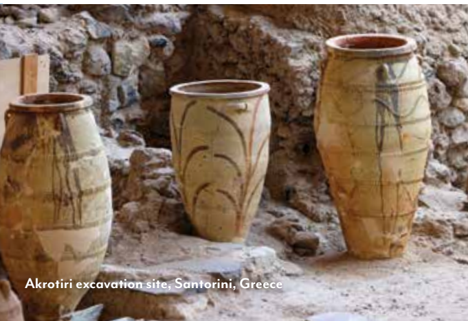
Akrotiri excavation site, Santorini, Greece

Arrive in Athens this morning. Disembark and continue on the Thebes and Delphi Post-Program Option or transfer to the airport for your return flight home. (B)