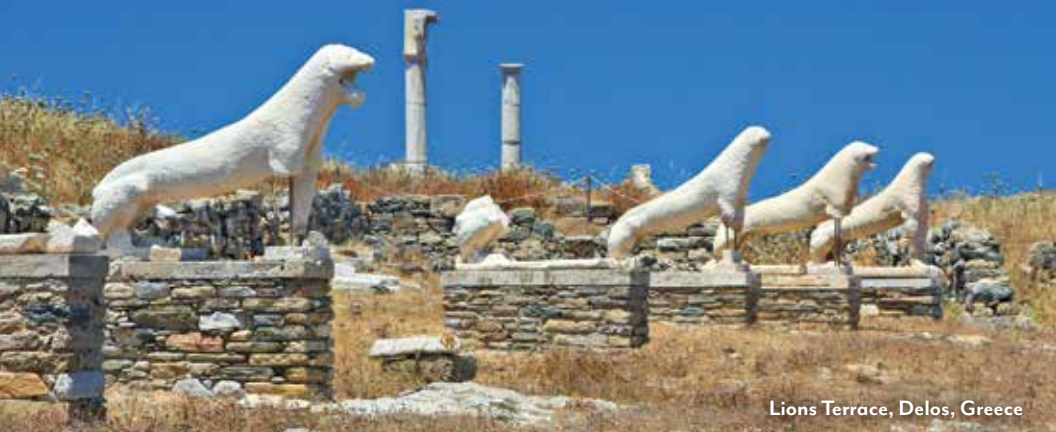
Lions Terrace, Delos, Greece

The Roman writer Cicero (106 to 43 B.C.) observed of Athens that “wherever you set your foot, you encounter some memory of the past.” In Greece and Turkey, the stories of antiquity come to life. St. John the Apostle is believed to have penned the Book of Revelation on Patmos; the legend of the lost utopian city of Atlantis lives on in Santorini; and it is on these mythological islands that Odysseus sought redemption in the Underworld and where Orpheus retrieved his first love. Visit the Hellenistic Grand Theater in Ephesus, walk the Sacred Way of Delos and discover ancient Akrotiri— the “Minoan Pompeii.” Enjoy exclusive cultural enrichments, including a folklore performance, a culinary demonstration and the Island Life® forum with residents of Patmos who will share their candid perspectives about life today.