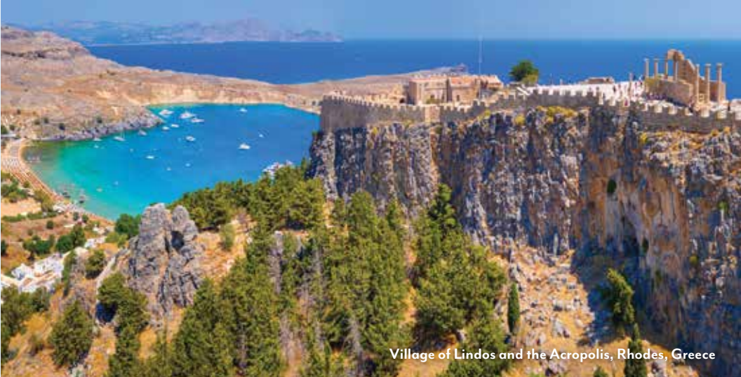
Village of Lindos and the Acropolis, Rhodes, Greece

St. John the Apostle most likely wrote the Book of Revelation in 95 A.D. This afternoon, meet and engage with local residents who will discuss daily life on the islands during the ISLAND LIFE® forum. (B,L,D)