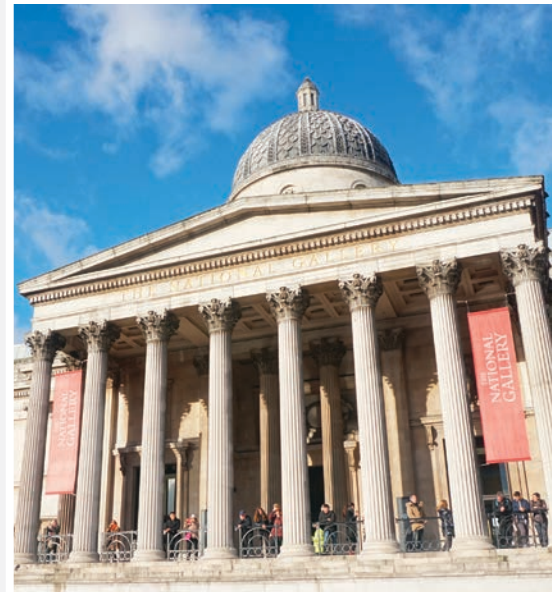
National Gallery, London