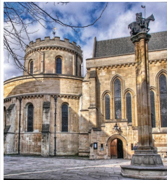
Photos (from top): The Battle of Trafalgar by J.M.W. Turner (1806); John Soane's Museum ; Temple Church