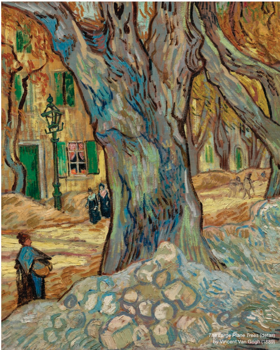
The Large Plane Trees (detail) by Vincent Van Gogh (1889)