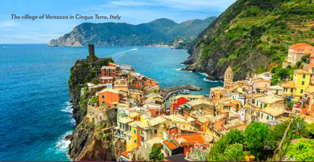
The village of Vernazza in Cinque Terre, Italy

city's medieval core with its range of architectural styles, shops, restaurants and cafes. Marvel at the incredible Palazzi dei Rolli. Visit Romanengo, the oldest confectioner in town—dating to 1780—and savor beloved local sweets. This evening go ashore in Portofino and spend free time exploring. From every vantage point the views are unforgettable! (B,L,D)