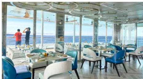
Al Fresco Patio Café.

Indoor-outdoor dining with Ecuadorian flair served in single, unassigned seating in the Patio Café and Yacht Club Restaurant. The atmosphere is sociable and informal, and menus feature local, sustainable ingredients, plant-based options and zero-proof cocktails.