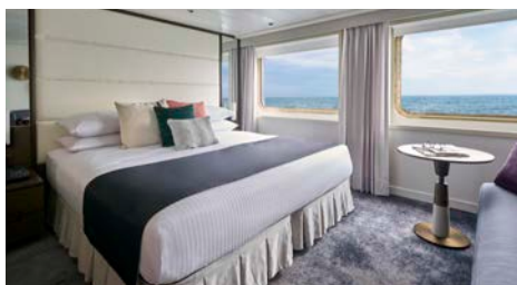
Especially spacious accommodations.

Staterooms and suites are spread across two decks with connecting, solo, and triple options; four even roomier Islander Suites with separate living area, table and chairs, and bath with bathtub. The Santa Cruz Suite can be reserved as a Family Suite with connecting