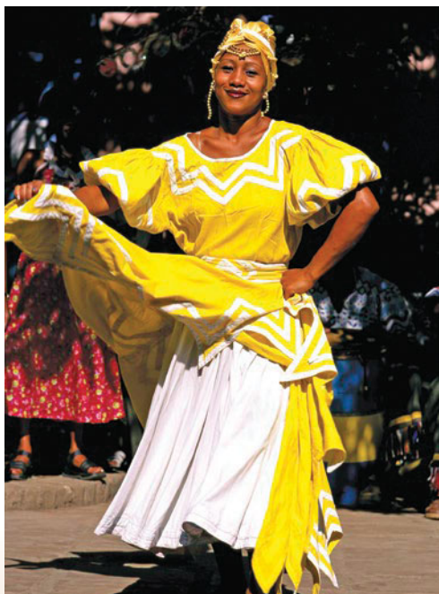
Top: Vintage automobiles, Havana Cover: Cuban jazz musician Mail panel: Old Havana | Afro-Cuban musician