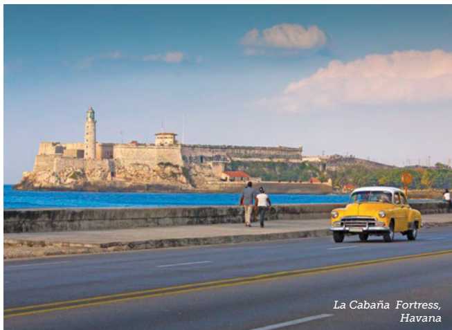
La Cabaña Fortress, Havana