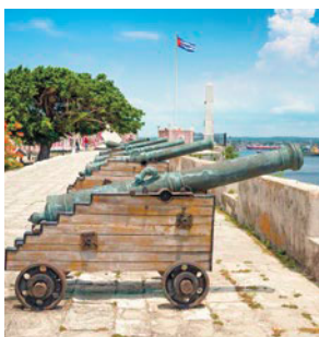
Cannons at fortification, Havana