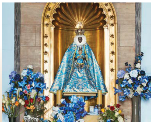
Black Madonna, Iglesia de Nuestra Señora de Regla

After lunch in Matanzas, visit the Sugar Mill Triunvirato to see the moving, 19th-century Monument to the Slaves' Rebellion.