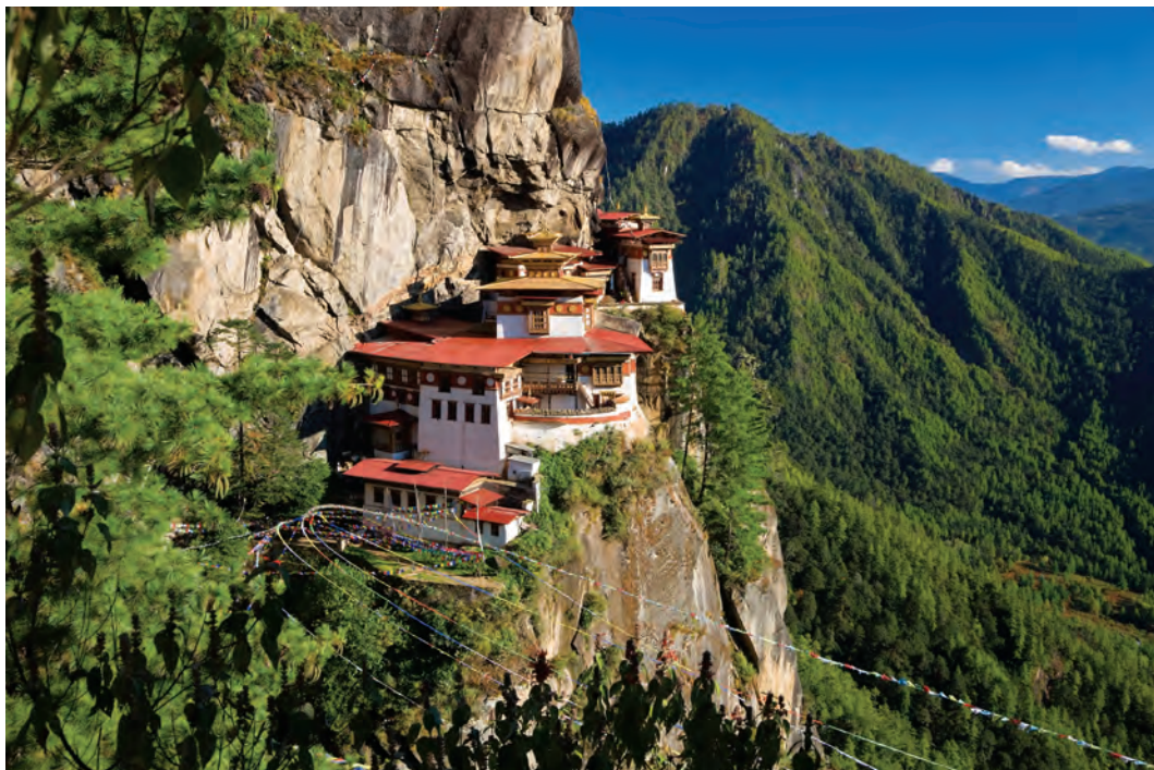
Climb to Tiger's Nest Monastery on Day 13.

all visitors. We travel on to Bhaktapur, the least developed of the valley's three cities. Virtually a living open-air museum with its unspoiled ancient square and warrens of medieval streets, Bhaktapur is known for its fine artisans and many temples. We have time to explore then continue the scenic drive to Nagarkot, a hilltop village commanding a spectacular vista of Nepal's major Himalayan peaks. B,L