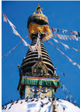
Nepal's Buddhist Boudhanath stupa.

Today we embark on a highlight of any trip to Bhutan: a visit to Paro Taktsang, the sacred